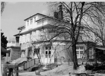
The Pikler Institute Lóczy, Budapest

This newsletter is published by Pikler/Lóczy Fund USA c/o Day Schools, Inc. 3210 S. Norwood, Suite C Tulsa, Oklahoma 74135 USA 918.665.0877 office 918.665.0965 fax www.dayschoolsok.com