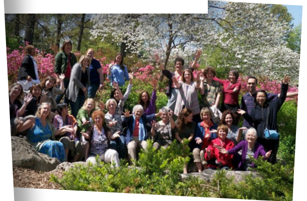
Pikler Intensive II, Tulsa Rose Garden.