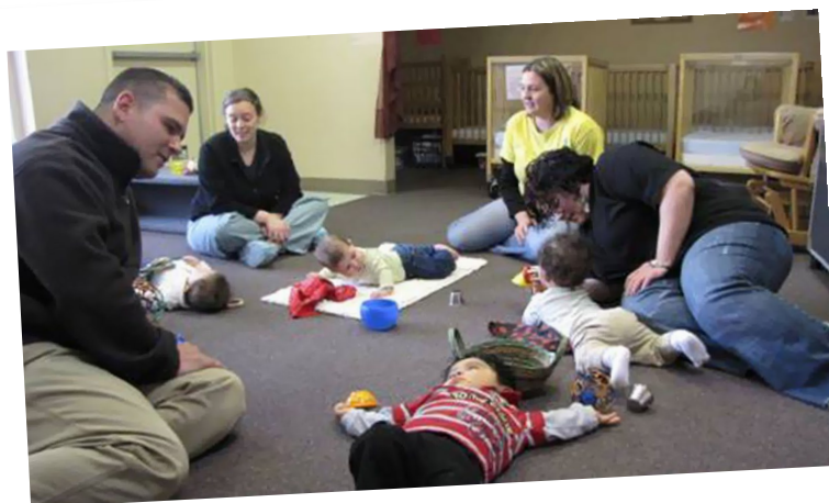
Parent infant class, Tulsa, OK.

Packed with useful information presented in a unique format that provides new or expecting parents with many of the essentials they need to care for their newborn babies with confidence.