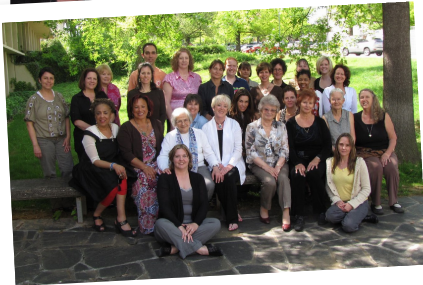
Pikler Intensive I participants.