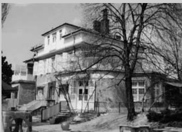
The Pikler Institute Lóczy, Budapest

This newsletter is published by Pikler/Lóczy Fund USA c/o Day Schools, Inc. 2437 South Sheridan Tulsa, Oklahoma 74129 USA 918.665.0877 office 918.665.0965 fax www.pikler.org